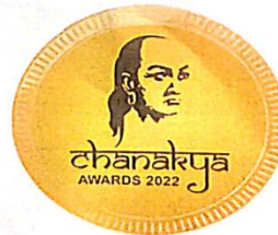
B. SREENIVAS MURTHY